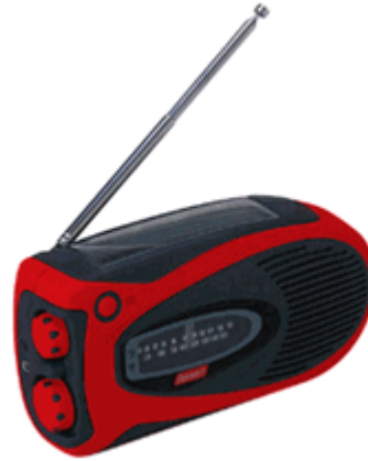
Crank Solar radio